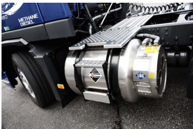
Volvo FM truck fuelled with LNG.

In Sweden, field testing with Volvo trucks that can run on LNG is carried out by transport companies DHL, Götene Kyltransporter and Renova. At the same time, Sweden's first filling station for LNG will open at the Stigs Center in Göteborg. The facility is a collaborative project between Volvo Trucks, FordonsGas Sverige and Göteborg Energi. Methane becomes liquid when it is cooled down to -160 °C. According to Volvo, trucks running on LNG combined with methane diesel technology have an operating range of 500 to 1000 km depending on driving conditions. This is twice the operating range of methane diesel vehicles running on CNG. Source: Volvo Trucks, Press Release, 20 October 2010 ( www.volvotrucks.com ).