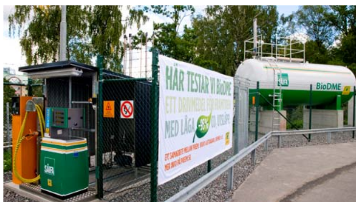
The first BioDME filling station was opened in Stockholm by Preem on 7 September 2010.

This pilot plant is part of the BioDME project, which has demonstrated the production of BioDME and its use in heavy trucks. The syngas generation for the plant is based on Chemrec's black liquor gasification technology. The BioDME synthesis and upgrading technology are provided by Haldor Topsøe A/S. Other important components of the project are the distribution system and the vehicle test fleet. "In addition to building the BioDME plant and getting the Volvo Truck test fleet into operation, we have also advanced on building an industrial-scale plant at the Domsjö specialty cellulose mill in Örnsköldsvik, Sweden," said Chemrec's CEO. Source: Chemrec, Press Release, 9 October 2010 ( www.chemrec.se ).