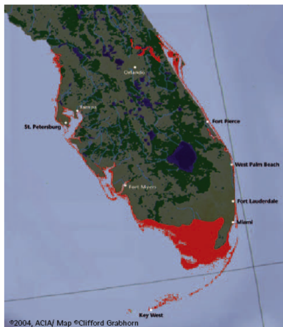
Areas in Florida Subject to Inundation with 100 Centimeter Sea Level Rise

The government proposes a massive reduction in CO2 emissions in advanced nations to levels one-fourth of those in 2002 by 2050 in the government's long-term energy policy outlines. According to the outlines, oil consumption in other areas but transportation will be almost zero by 2050. By 2100, natural gas will remain as an energy source for industry and transport, but most energy needs will be met by renewable energy sources such as nuclear power, hydrogen energy and solar energy. www.fuelcelltoday.com